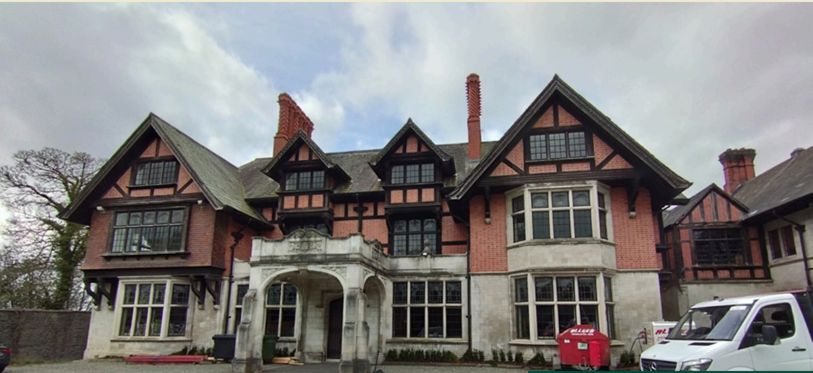
Glenmaroon House, the main location on ABIGAIL

Location choices can be a vital part of sustainability on a production, whether it be power availability or proximity from set to basecamp. Overall, fewer locations = fewer moves, which can reduce transportation emissions significantly.