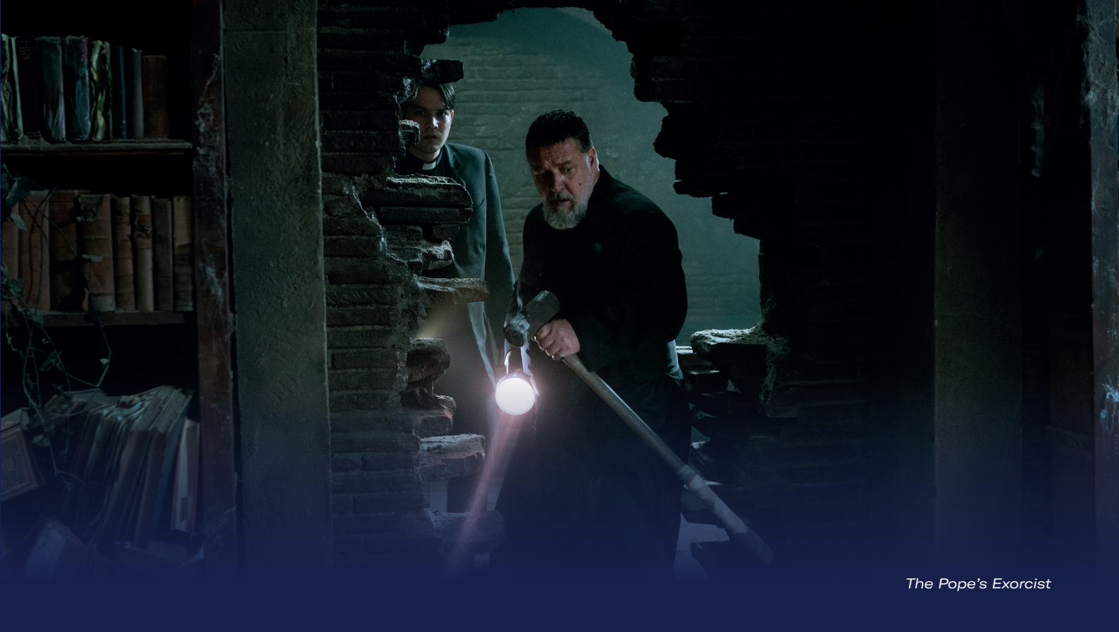
The Pope's Exorcist