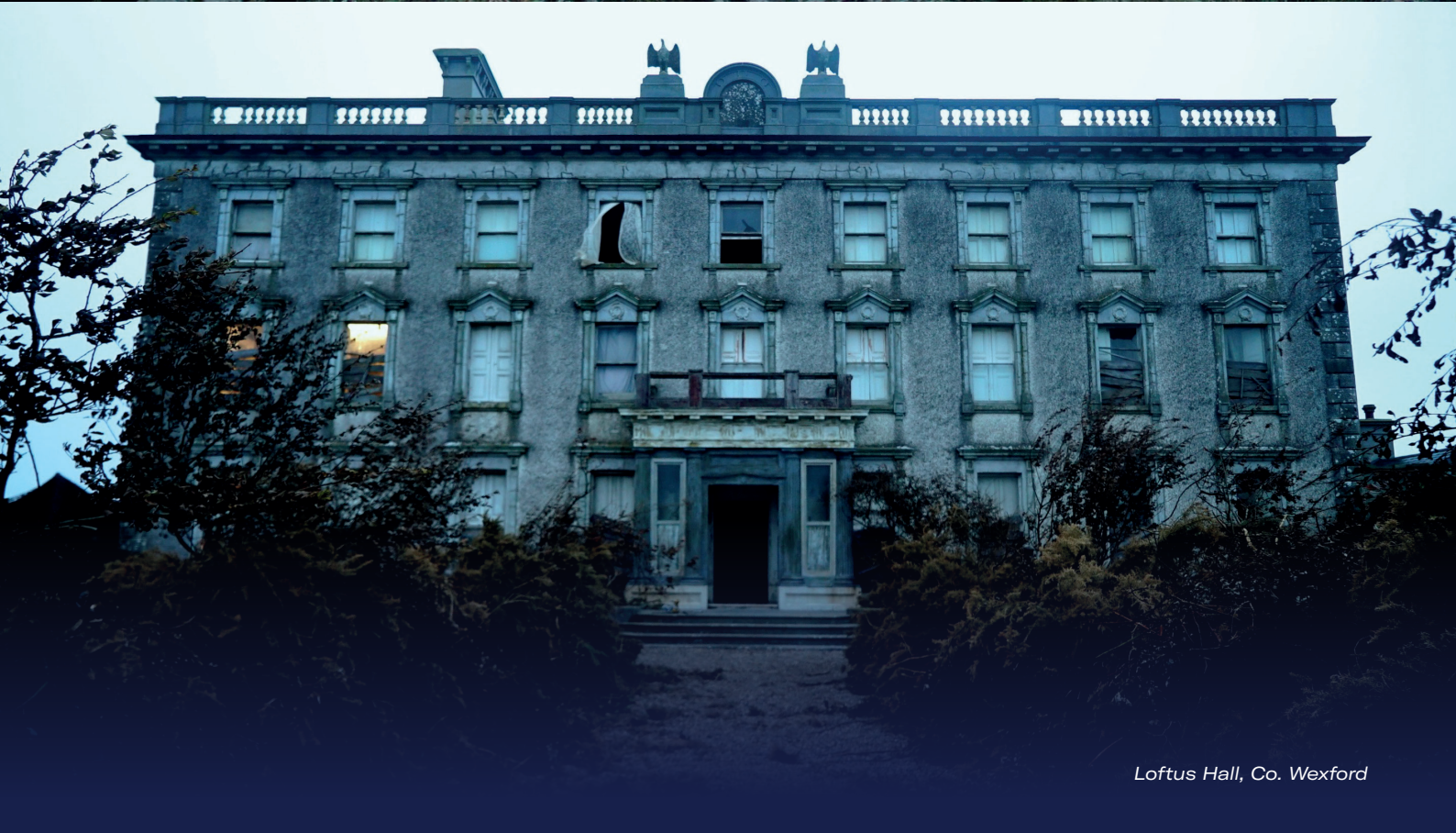
Loftus Hall, Co. Wexford