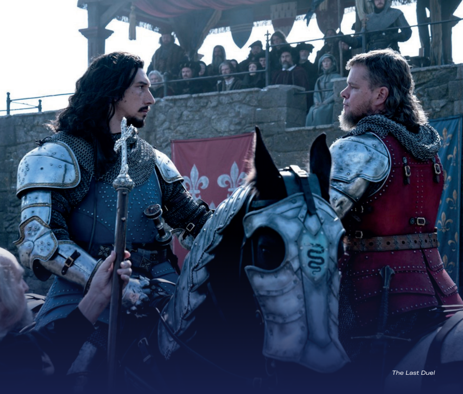
The Last Duel

“Screen Ireland welcomed me, my cast, and my entire production team on The Last Duel with open arms and accommodated our every need. The spectacular locations and excellent local crew made our experience one of the best I’ve had.”