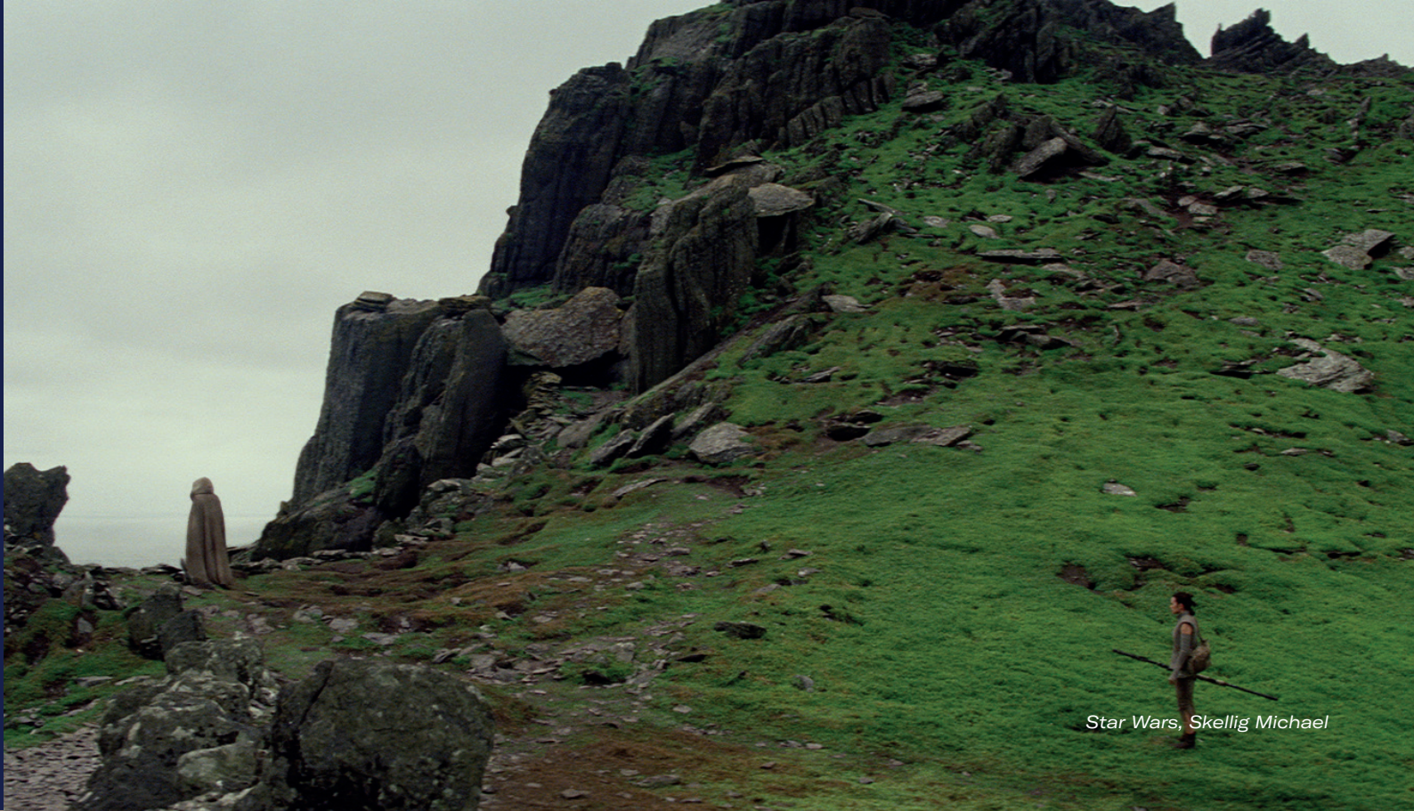
Star Wars, Skellig Michael