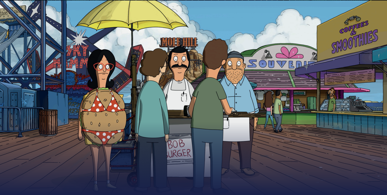
The Bob's Burgers Movie