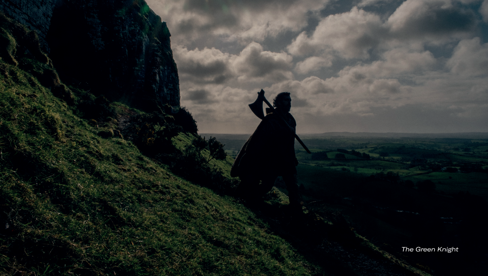
The Green Knight