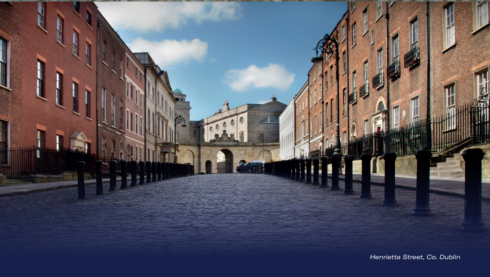
Henrietta Street, Co. Dublin