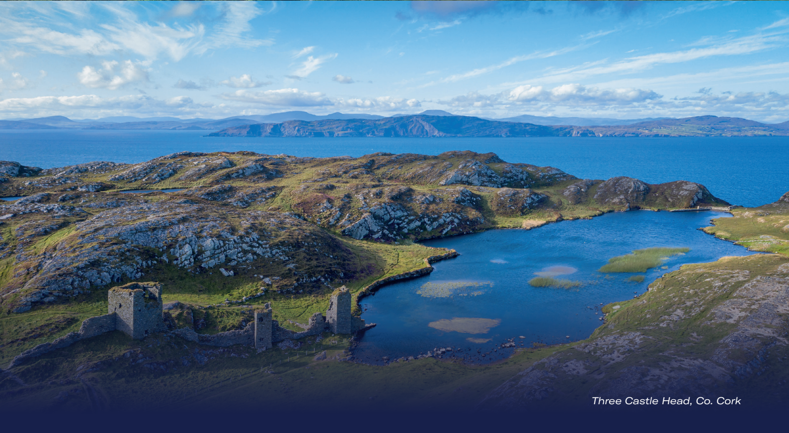
Three Castle Head, Co. Cork