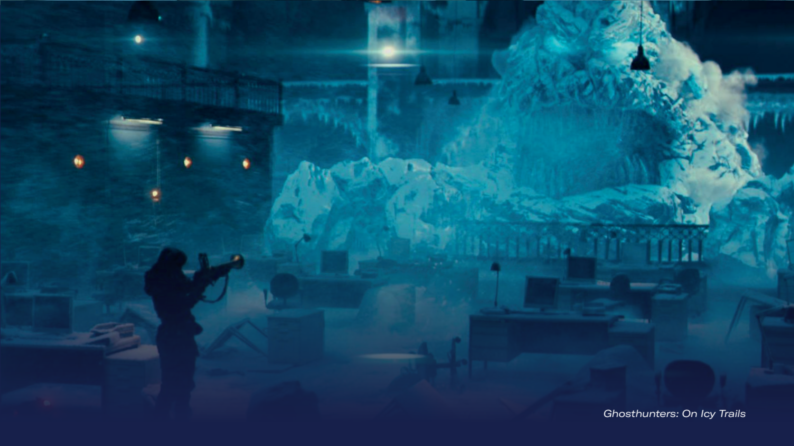
Ghosthunters: On Icy Trails