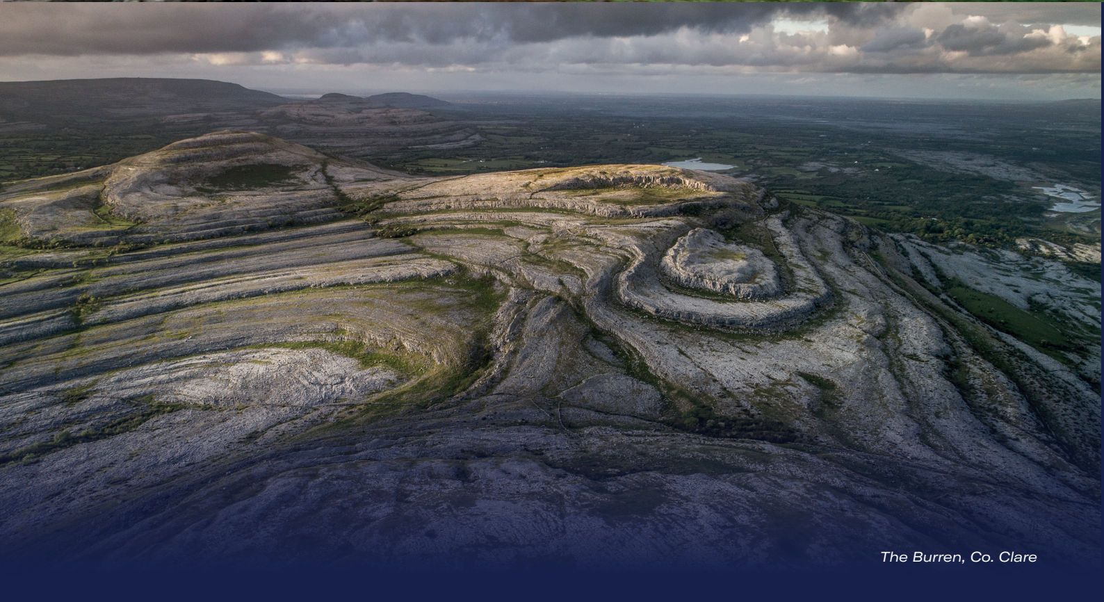
The Burren, Co. Clare