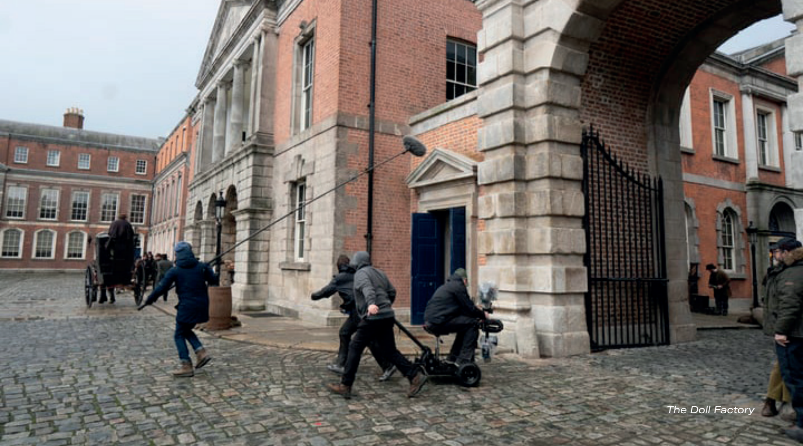
The Doll Factory