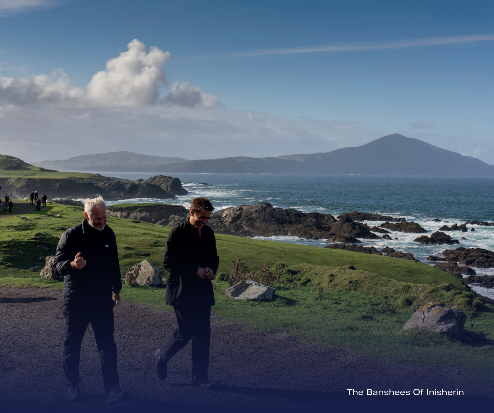
The Banshees Of Inisherin

“We had the most amazing time making The Banshees Of Inisherin on the West coast of Ireland; The most talented and fun crew and technical support, the most beautiful locations on Inishmore and Achill, the kindest support and assistance from the islanders. Everything on the movie, from behind the camera to location management to production facilities to catering, was world class, and I can’t wait to make another film there as soon as possible.”