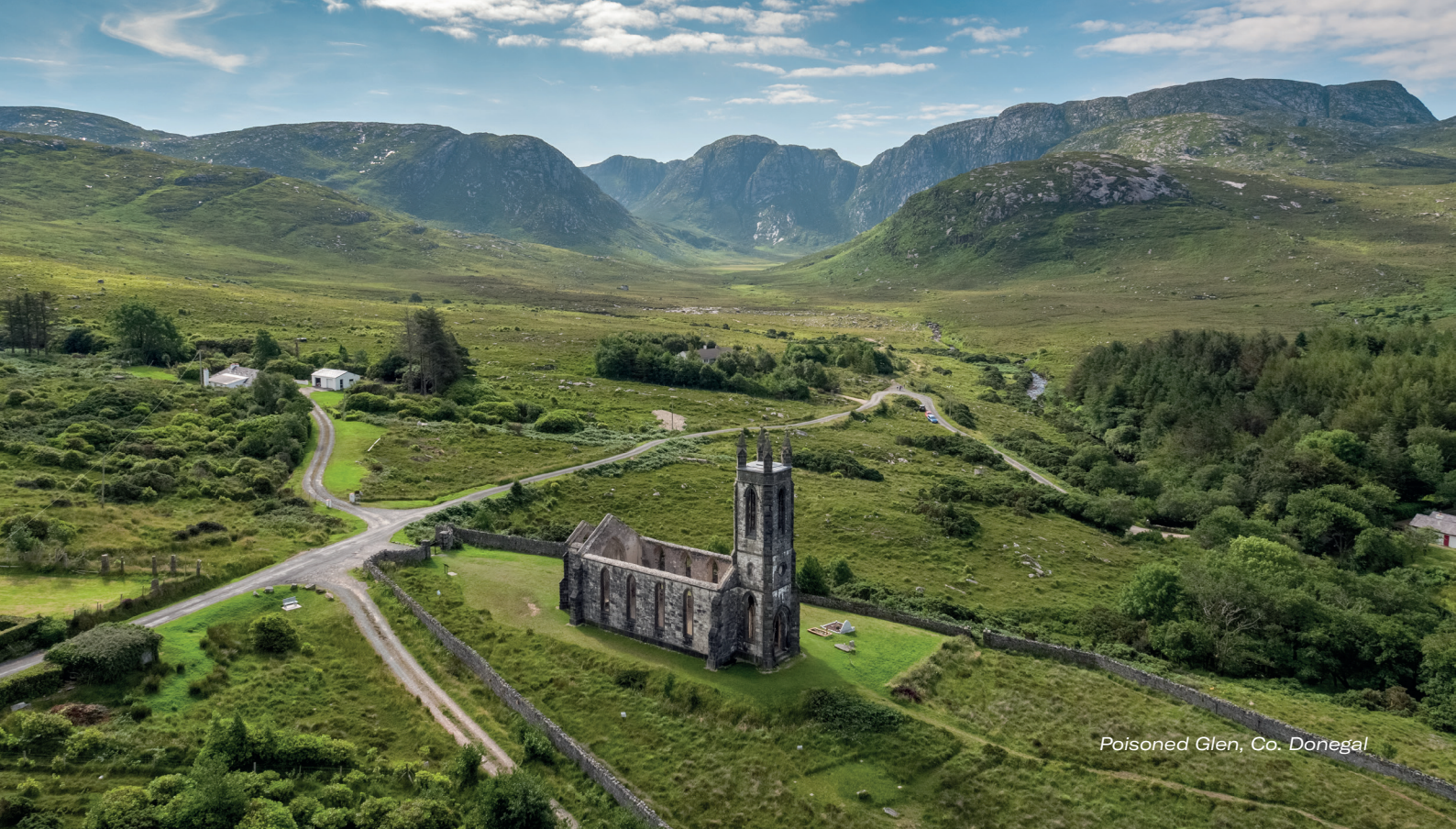
Poisoned Glen, Co. Donegal