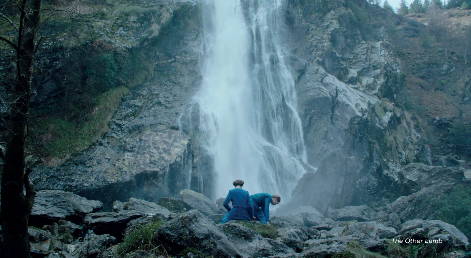
The Other Lamb